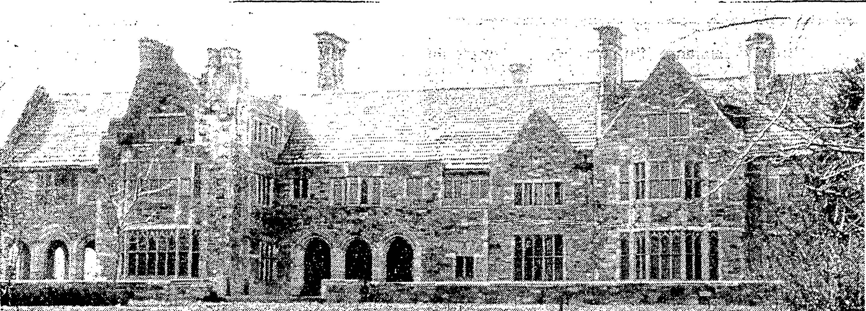
John Dodge spent $3 million on this Detroit mansion with 110 rooms and 24 baths . . . but he died before it was completed.