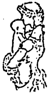
The truth of his origin is the birth-right of every man.